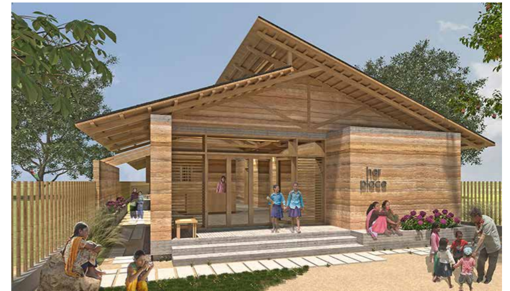
Honourable Mention, Studio C+C & Studio 4215

"The intent with our design proposal was to provide a safe and flexible space for learning, designed to be environmentally sustainable and cost-effective, constructed using local materials and traditional methods and help empower the young women of Devachuli and the rural areas around"