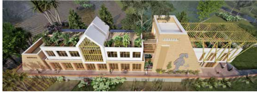
The private gardens on the roof create a place of solitude and reflection

The following projects received honourable mentions: