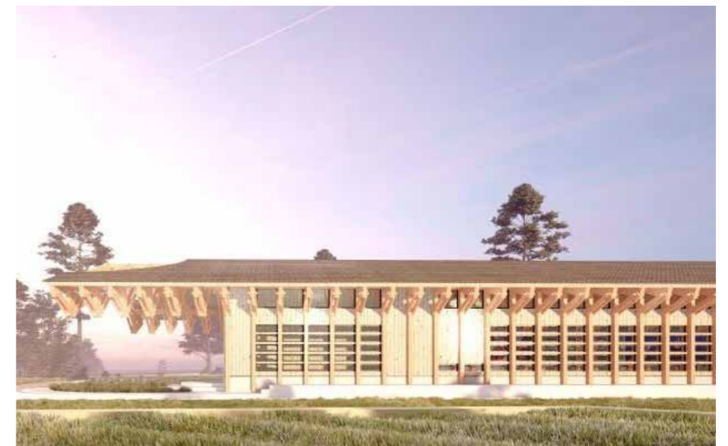
Honourable Mention, Xinghong Wang

"The intent with our design proposal was to provide a safe and flexible space for learning, designed to be environmentally sustainable and cost-effective, constructed using local materials and traditional methods and help empower the young women of Devachuli and the rural areas around"