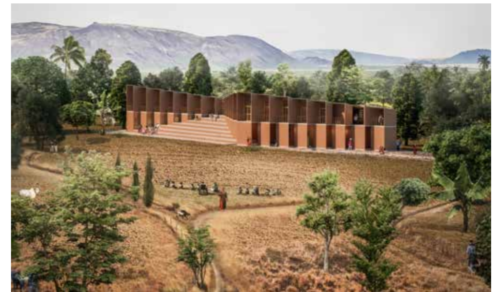
Honourable Mention, THE ARCHITECTURE STORY

"We were happy to participate in the competition and contribute to this useful goal in Nepal"