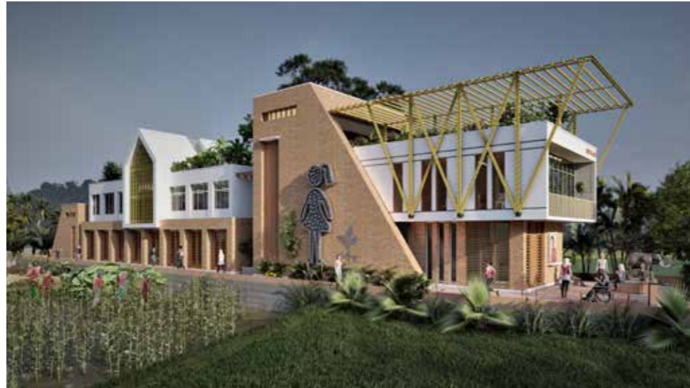
View of the elevation

"It is a great deal for us designers to see our design realized. When we heard about the competition on our turf, we wanted to contribute to this social cause. Our concept was to design an iconic building to represent women's strength, while also providing a safe and supportive environment. We were very meticulous about the building materials and wanted to implement economic sustainability through architecture. We hope our design serves the purpose and empowers women in the society."