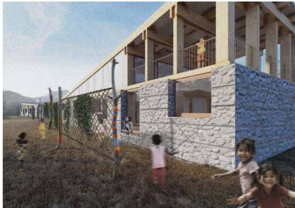
Honourable Mention, Sonja Walzik, Hanna Bederke, Clara Kühn

"The conglomerate of buildings is meant to mimic a village of their own where the children can feel safe, have their own rules, are encouraged to learn and befriend fellow peers."