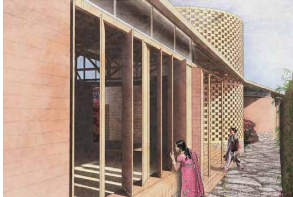
Honourable Mention, RTA Studio